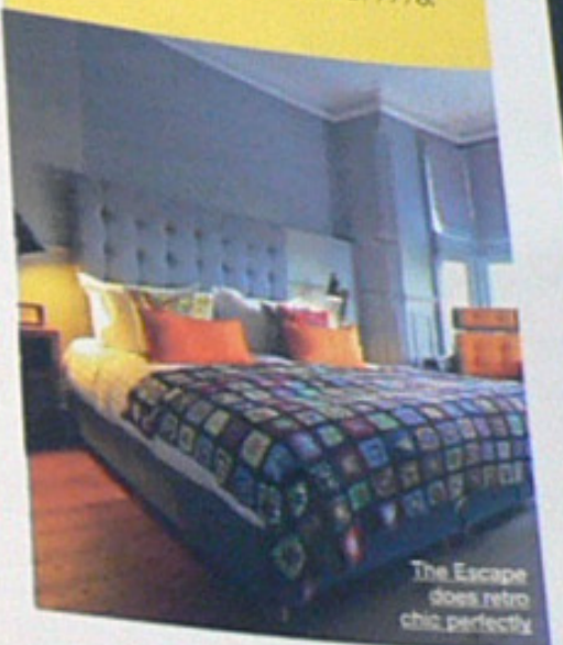
The Escape does retro chic perfectly

5 RETRO FUN Escape, Llandudno, Conwy, North Wales Chic and fun, the Escape B&B mixes up retro 1970s styling with designer details. Room One's technicolour crocheted throw and orange Eames-style chairs are the perfect foil to the muted grey décor and wooden floors. And breakfast – wow, the full Welsh is delicious and made from local produce. While you're there: Llandudno's huge sandy beaches await you. Take the cable car up the Great Orme, the hill that backs on to the town. Or go kite surfing at Kinmel Bay ( kiteboardinglessons.co.uk ). The lowdown: from £89 per night, visit escapeandb.co.uk or call 01492 877776.